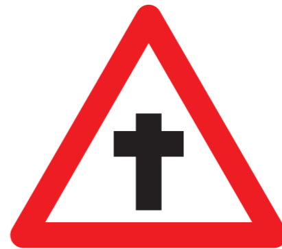
Thoughts of death or suicide