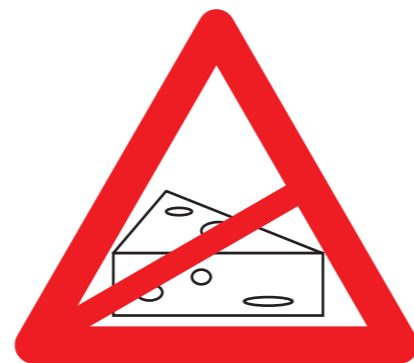
Appetite or weight change