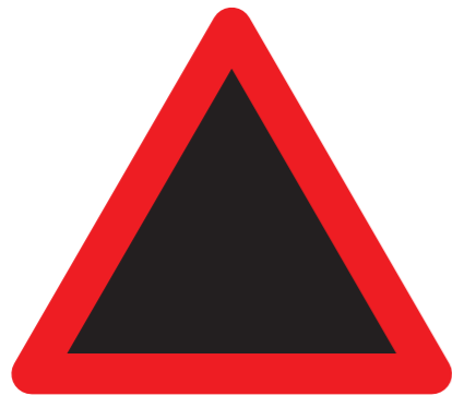
Feelings of hopelessness and pessimism