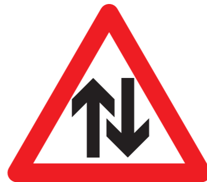
Changes in mood