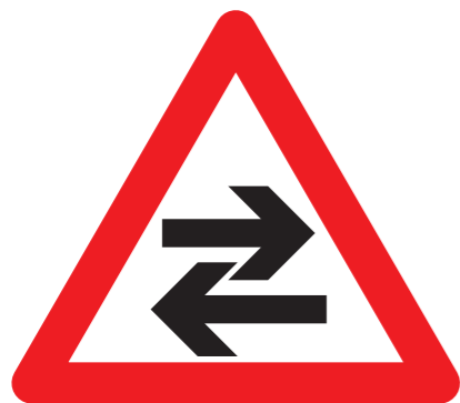
Difficulty making decisions