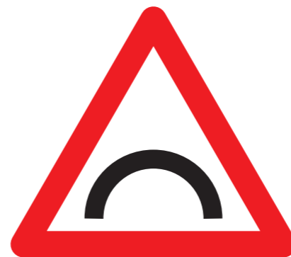
Persistent sad, anxious or empty mood